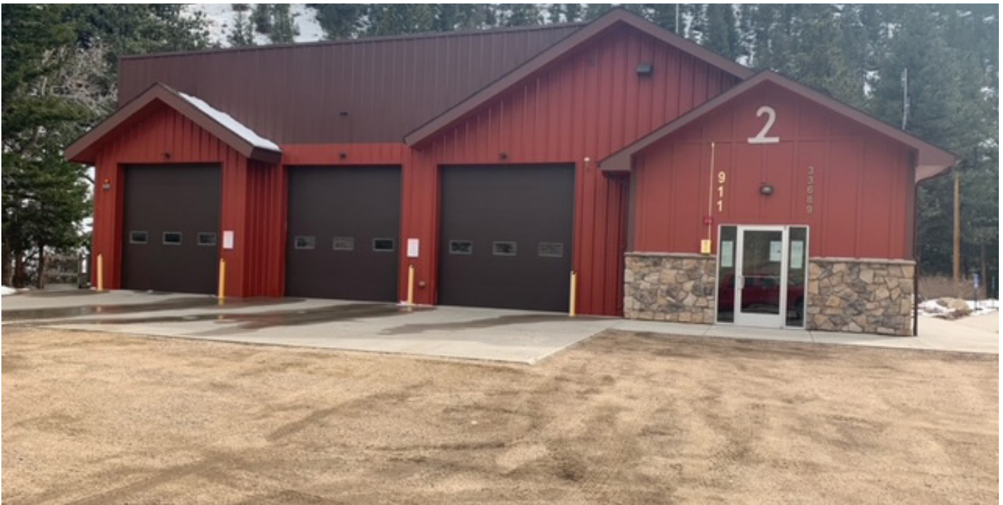
PCFPD's Station 2 in Rustic.

To see the entire Colorado Wildfire Risk Assessment for Rustic , click here .